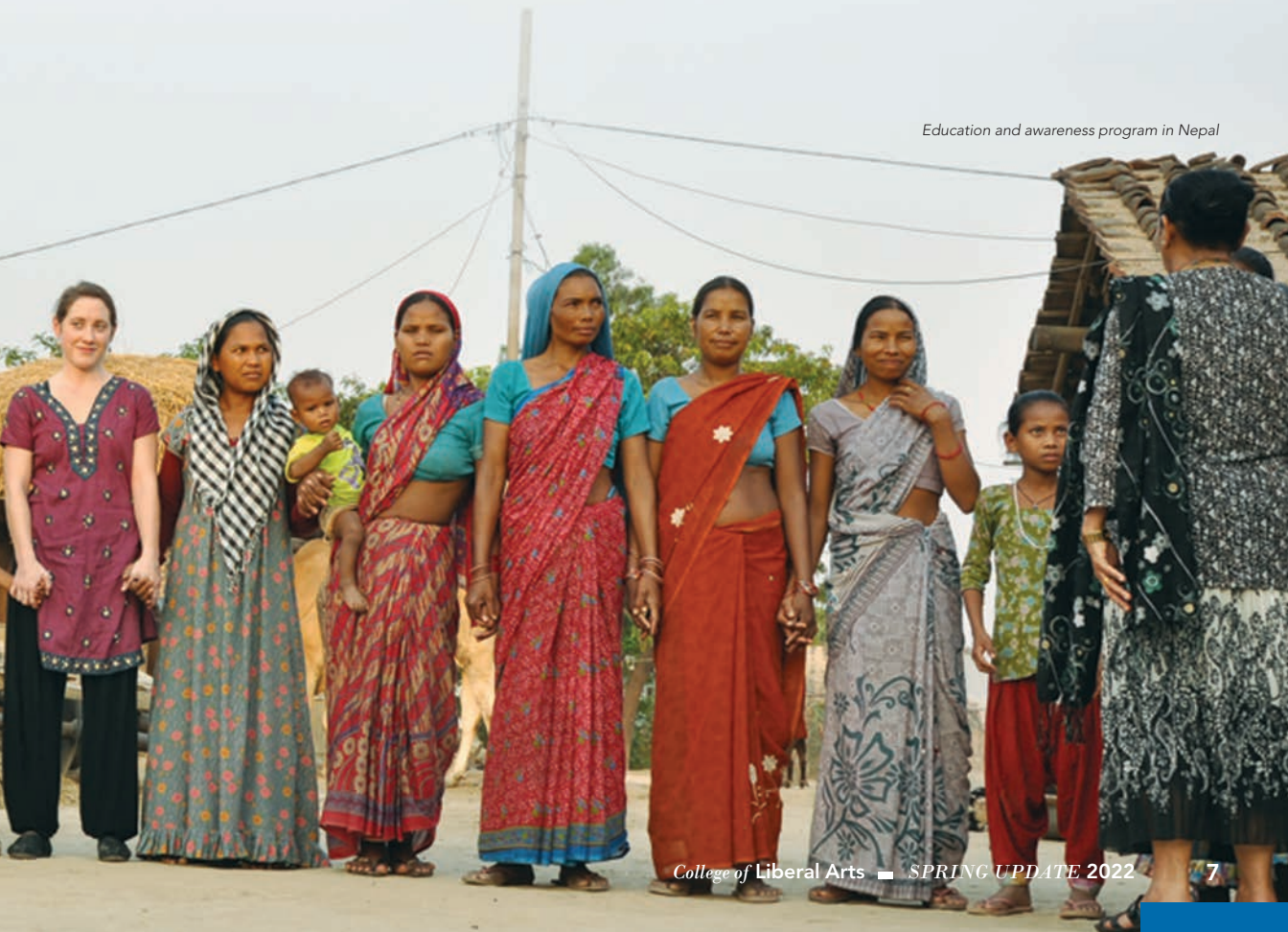
Education and awareness program in Nepal