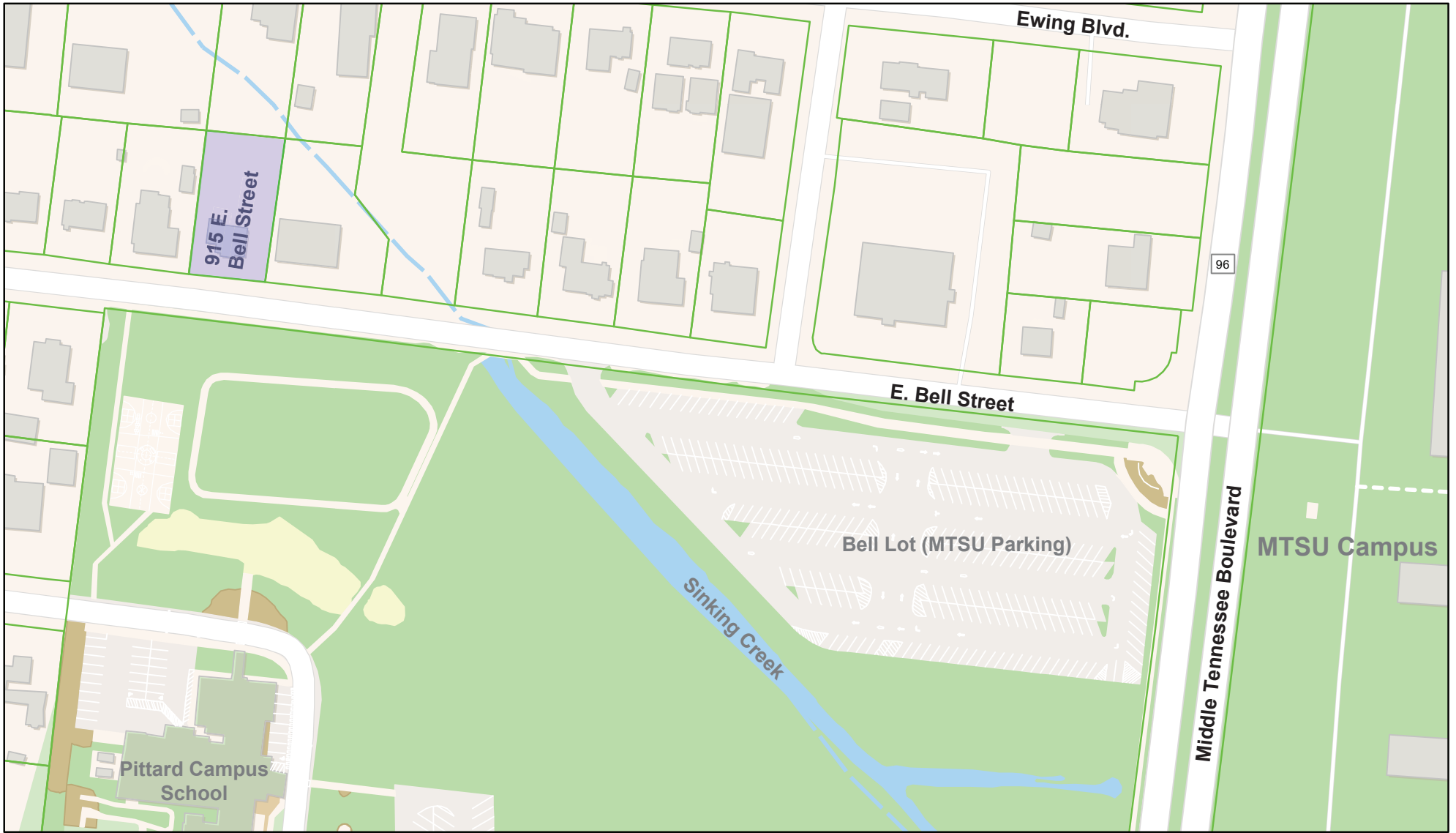
Site Vicinity Map 915 E. Bell Street