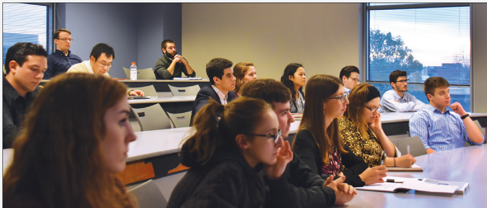
BAP attendees listen to a presentation by HCA.

Beta Alpha Psi (BAP), an international honor organization for financial information reporting majors and professionals, provides its members with an infinite field of opportunities for advancement and professional development to launch into their career. With a five-year superior status distinction, the Jones College of Business's Zeta Gamma chapter has created exceptional value for its members and community.